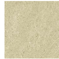
MOCHA G30921 30X30CM 11.8X11.8"