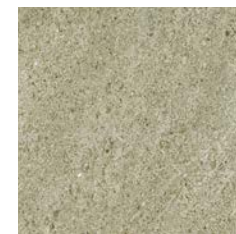
GREY G30922 30X30CM 11.8X11.8"