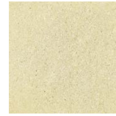
BEIGE G30920 30X30CM 11.8X11.8"